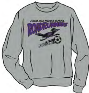
Crew Neck Sweatshirt

To order one of these, please use the order form below.