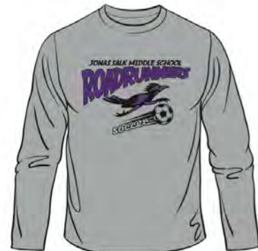
Long Sleeve T-shirt